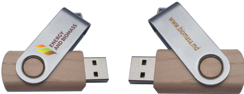
Item 4 - Wooden USB Memory Stick