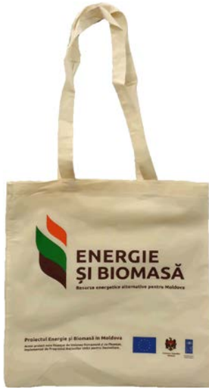
Item 1 - Cotton bag