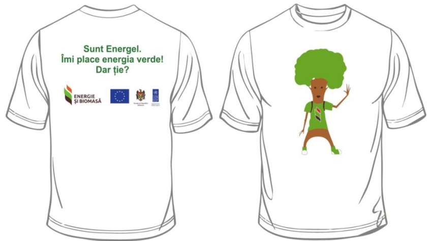
Item 2 - T-shirts (unisex) Energel